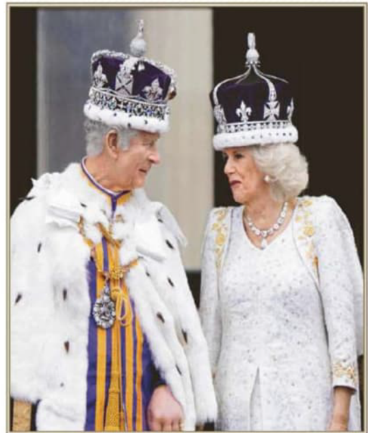
HISTORIC ROYAL COLLECTOR'S EDITION

AVAILABLE IN SHOPS, AND AT ok.co.uk/king